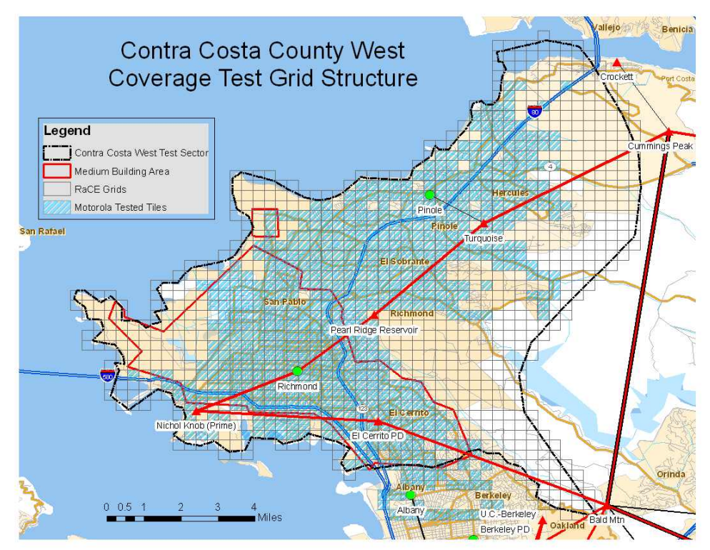
Figure 1 - Test Sectors

In June 2011 AECOM performed coverage testing. Our testing collected two types of data on system performance: Delivered Audio Quality (DAQ) and Received Signal Strength Indication (RSSI). Unique to RaCE testing, DAQ is measured in both directions: one direction is that of a radio user talking in to the system (talk-in), and the other is that of the system talking out to a radio user (talk-out). Traditional testing (e.g., RSSI and Bit Error Rate (BER)) only measure performance in the talk-out direction.